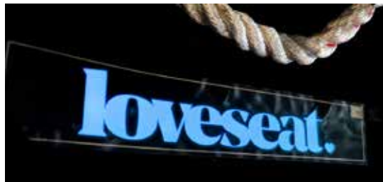
Luminous Sticker logo