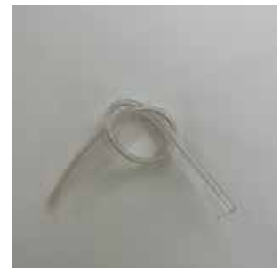
Clear pvc piping