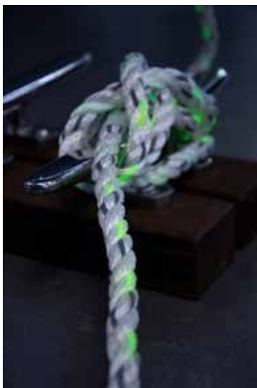
Floating Rope for mooring